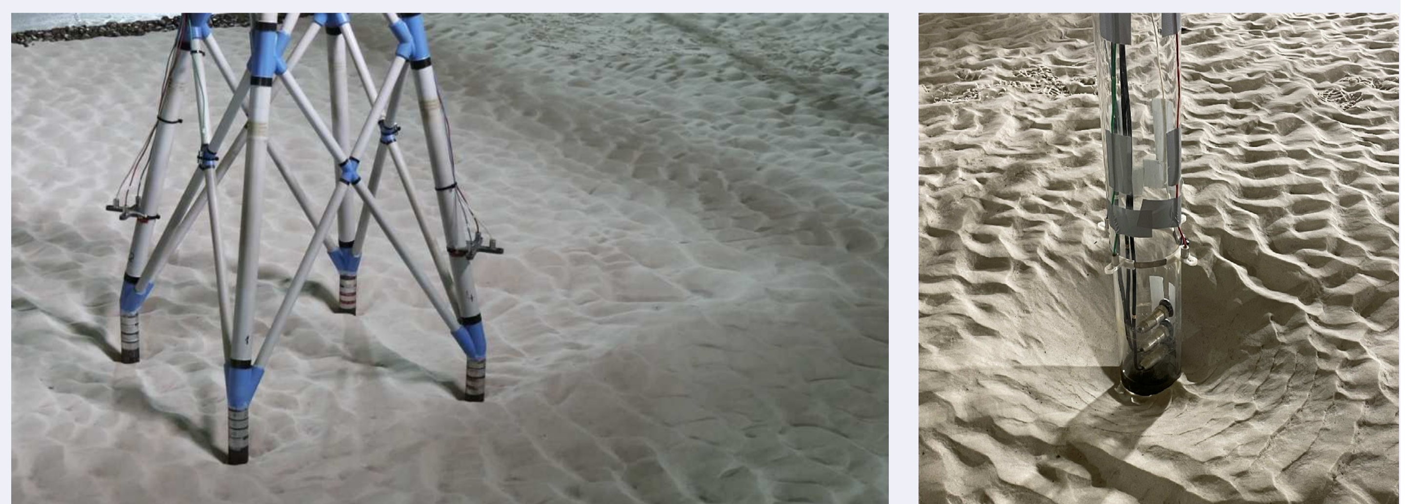
Scour development around different foundation structures (left: jacket; right: monopile) during model test in a 3D wave-current basin.