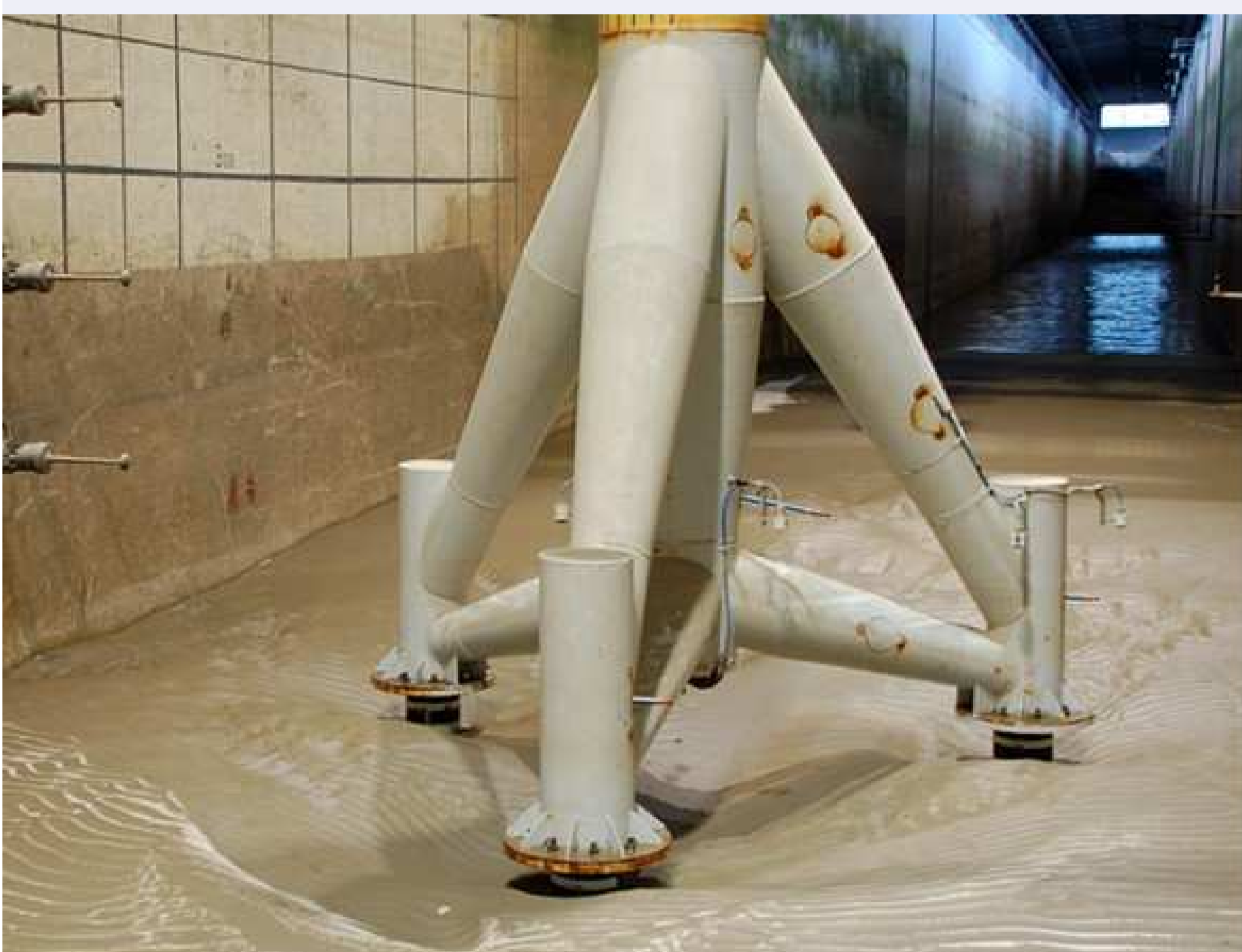
Scour development around a tripod foundation structure. Large scale model test in the Large Wave Flume (GWK).

Offshore wind energy structures (OWES) present a physical barrier on the seafloor and in the water column.